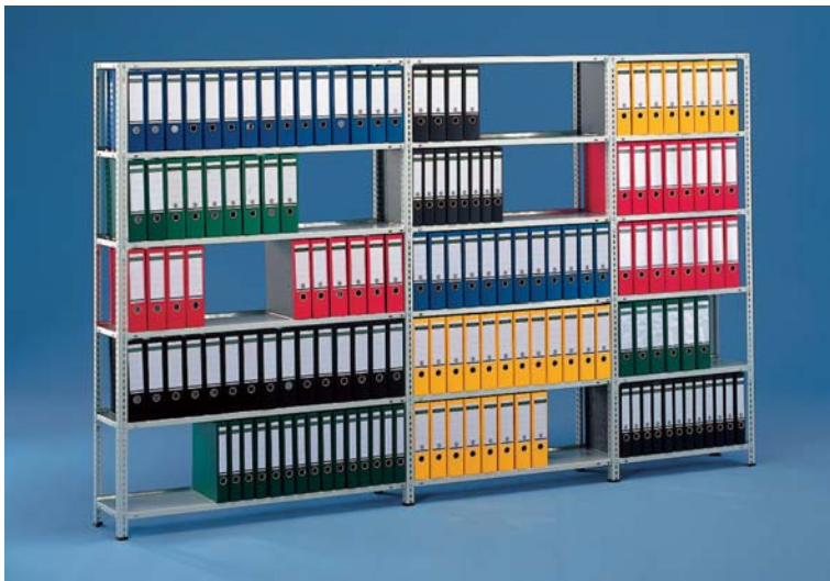
Bolted office shelving with top shelf as dust cover: 1850 mm high, 300 mm deep. RAL 7035 light grey. Illustrated with three different shelf widths – see full range.

META COMPACT® Bolted shelving: The economical solution for the storage of archives and records. Offers optimum storage capacity for box and ring binders or publications.