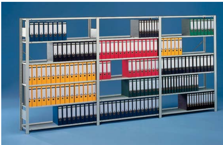
Single sided run of boltless office shelving with top shelf as dust cover. Light grey RAL 7035 – 1850 mm high and 300mm deep. Illustrated with 1250 mm high and 300mm deep. Illustrated with 1250 mm high and 300mm deep. Standard bays below with 1000 mm wide bays.

META COMPACT® boltless office shelving blends into every office environment. The general dimensions of the bays are ideal for the storage of box files, ring binders and documents. The shelving is easily assembled in the office (or confined document store)